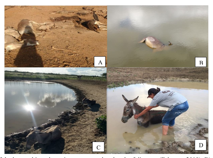
Figure 2 - A) Bodies of donkeys subjected to mistreatment and outbreak of diseases (February 2019). B) Animal drowned in the "watering area". C) Downed animals, without being able to stay in quadrupedal position without nursing aid. D) Donkey being saved by veterinary professional Aline Rocha, after being "stranded" in the dam (strenuous daily routine work).

The only water source had margins of mud that several times caused falls, jamming, and sometimes even the death of debilitated animals (Figure 2A, 2B, 2C, and 2D).