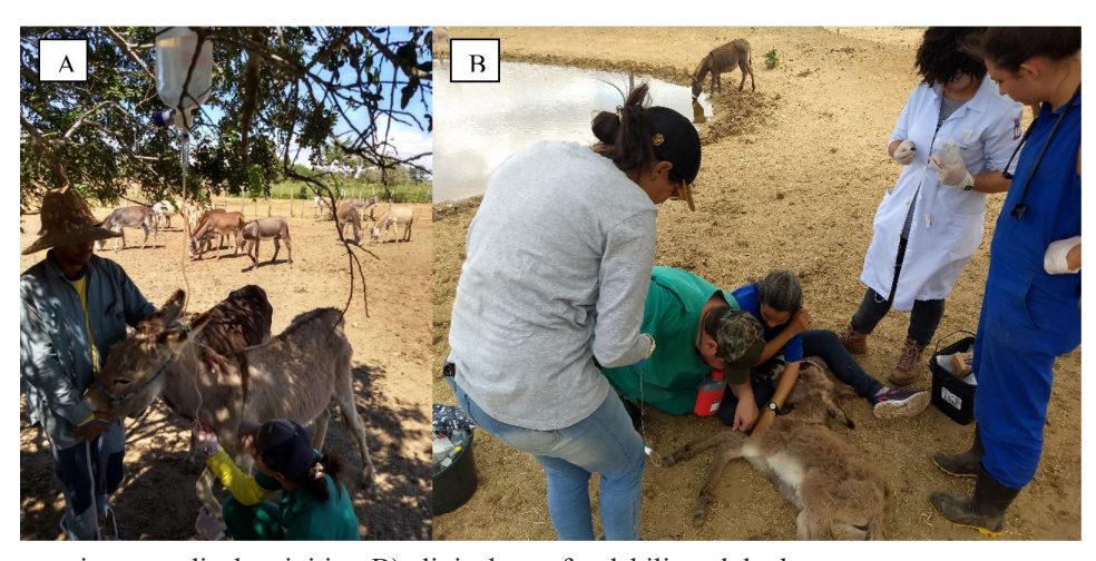
Figure 3 - A) Daily veterinary medical activities. B) clinical care for debilitated donkeys.

In the first month of adaptation after the transfer, of the 20 animals that arrived in precarious conditions, 19 died, the remaining 180 donkeys, 67 males (40 castrated, 1 cryptorchid, and 26 stallions) and 113 females. The action of transferring