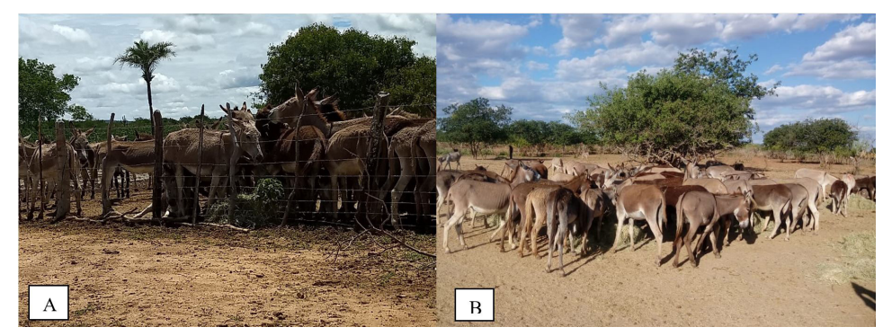
Figure 1 - A) Agglomerated animals on a farm in the municipality of Canudos-BA, a warehouse for slaughter. B) Supply of grass hay twice a day after the arrival of the Task Force.